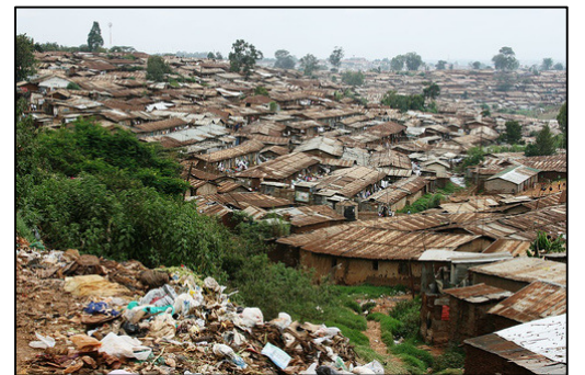
An aerial view shows Kibera's overcrowded housing conditions