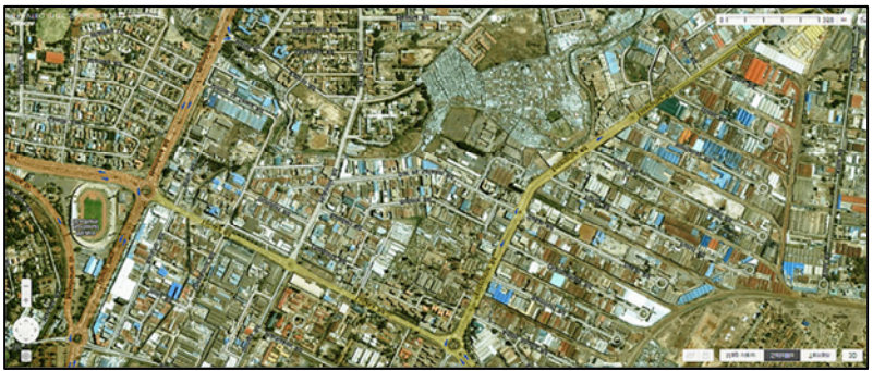
An aerial view of Mukuru slum